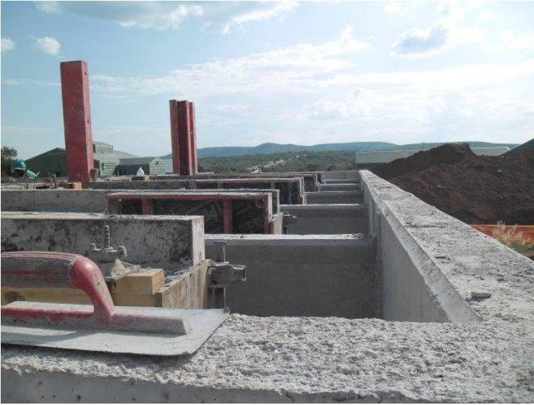
4.1.2 Southern Flocculation Channels